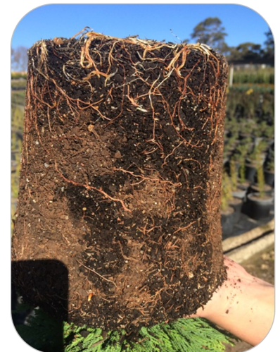
Figure 1. Severe water repellency can result in dry patches and water channelling through the media.

Plants may also suffer from the effects of relatively mild water repellency even before the media shows visual signs of dry patch. In the early stages of development, moisture storage in the growing media will be affected.