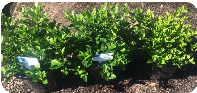
Figure 4. Reapplication of Hydraflo to Gardenia Florida improved leaf size, leaf colour and reduced the time to sale.

Gardenia Florida were topdressed with granular Hydraflo 2 at 0 grams, 1 gram and 2 grams per litre. At 50 days after treatment, plants treated with Hydraflo had larger leaves and improved leaf colour (Figure 4). At 2 g/L, 100% of the treated plants were saleable. At 1 g/L 65% of the treated plants were saleable. When left untreated, only 53% of the plants were saleable.