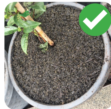
Figure 5. Pre-emergent herbicides need to be applied evenly across the surfaces of pots and at the correct application rate.