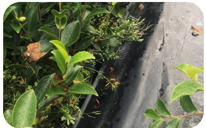
Figure 2. Tubestock should be weed free to prevent the spread of seeds throughout the nursery.