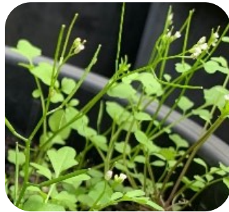
Flickweed Cardamine sp.

germinate, grow, flower and set seed within a typical spraying or hand-weeding rotation. Successful weeds often have large seed numbers and minimal dormancy periods. This helps them to spread, germinate and reproduce within short periods of time.