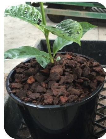
Figure 4. Mulches with low nutrient levels may also provide a weed-resistant surface.

Pre-emergent herbicides are an invaluable tool to help minimise weed germination and establishment. To be effective, applications need to be done in a timely fashion (within 24 hours of potting up or hand weeding). Applications should be at the correct label rate and with an even distribution across the surface of pots or area applied (Figure 5).