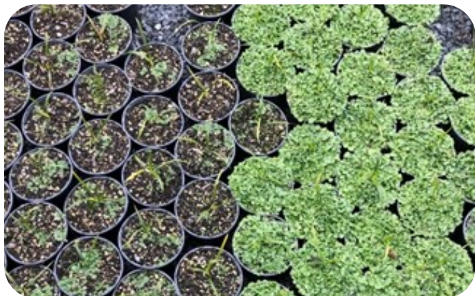
Figure 3. Applying fertiliser on the surface of pots can increase weed growth (right) compared to subsurface application (left).