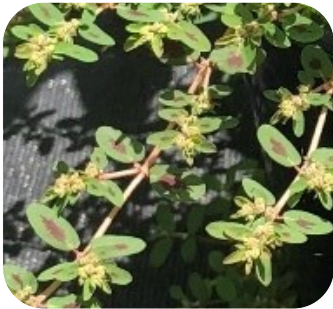
Spotted Spurge Chamaesyce maculata